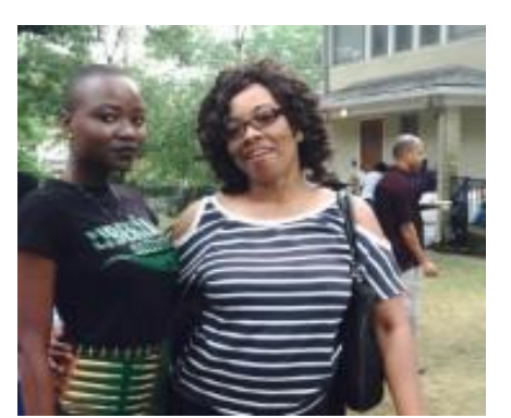
Embassy of Liberia staffers hanging out at the picnic