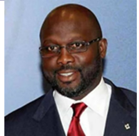
H. E. George Manneh Weah , President: 2018-

Among the founders of the ACS were many prominent early American leaders, including Thomas Jefferson, James Monroe, Daniel Webster, Francis Scott Key, Henry Clay, and Bushrod Washington, an associate justice of the Supreme Court and nephew of George Washington. Liberia's capital, Monrovia, is named after James Monroe, the fifth president of the U.S during whose