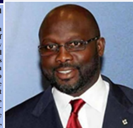
H. E. George Manneh Weah President: 2018-

Liberia's declaration of independence in 1847 was spearheaded by Joseph Jenkins Roberts, born in Norfolk, VA, U.S.A., who was then Governor of the Commonwealth of Liberia, and became the first president of the new country. Liberia, which derives her name from "liberty," meaning "land of the free," was founded in 1822 by former slaves and free-born Blacks from the United States, under the auspices of the American Colonization Society (ACS). The ACS was a philanthropic organization chartered to find a new home in Africa for freed men and women of color from the United States. Among the founders of the ACS were many prominent early American leaders, including Thomas Jefferson, James Monroe, Daniel Webster, Francis Scott Key, Henry Clay, and Bushrod Washington, an associate justice of the Supreme Court and nephew of George Washington. Liberia's capital, Monrovia, is named after James Monroe, the fifth president of the U.S during whose administration the country was founded. The first Liberian Constitution was written at Harvard Law School. The country's three branches of government, the Legislature, Executive and Judiciary are modeled after the system of government of the U.S. (Cont'd on page 4)