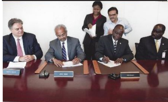
Amb. Sulunteh signs World Bank agreement on behalf of Liberia