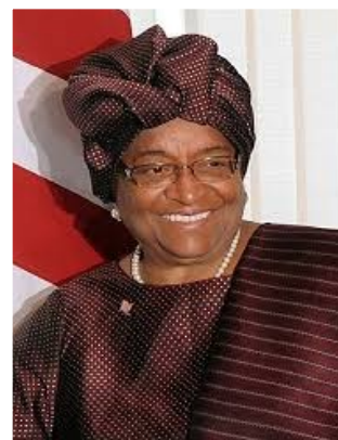
Ellen Johnson Sirleaf 24th President 1st Female President 2006 to Present

Liberia's declaration of independence in 1847 was spearheaded by Joseph Jenkins Roberts, born in Norfolk, VA, U.S.A., who was then Governor of the Commonwealth of Liberia, and became the first president of the new country. Liberia, which derives her name from "liberty," meaning "land of the free," was founded in 1822 by former slaves and free-born Blacks from the United States, under the auspices of the American Colonization Society (ACS). The ACS was a philanthropic organization chartered to find a new home in Africa for freed men and women of color from the United States