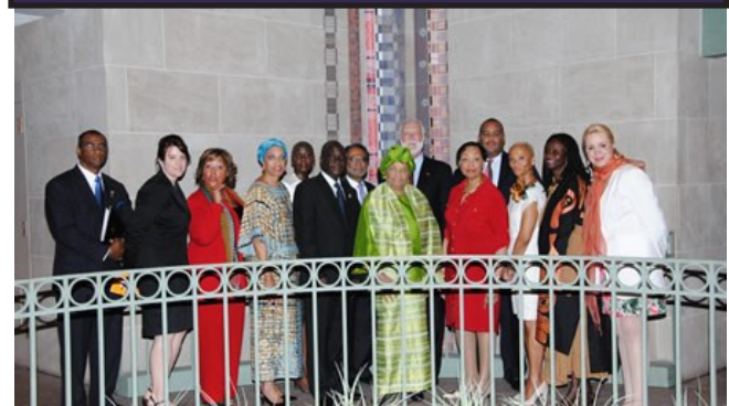
Pres. Sirleaf and Amb. Sulunteh with other dignitaries at the Smithsonian National Museum of African Arts.