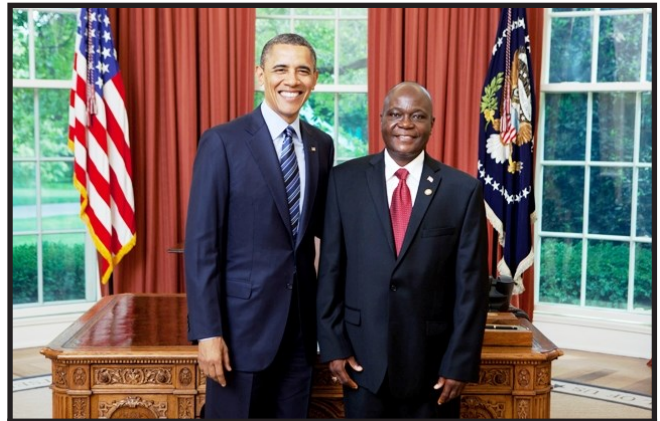
Pres. Obama with Amb Sulunteh at the White House after presenting Letters of Credence