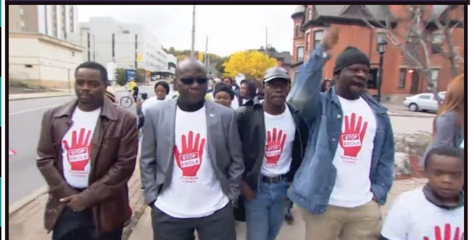
Amb Sulunteh marches with residents in Canada in support of the campaign against Ebola