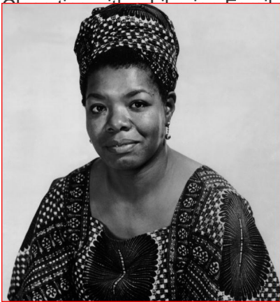
MAYA ANGELOU – AUNT MAYA