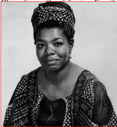
MAYA ANGELOU – AUNT MAYA