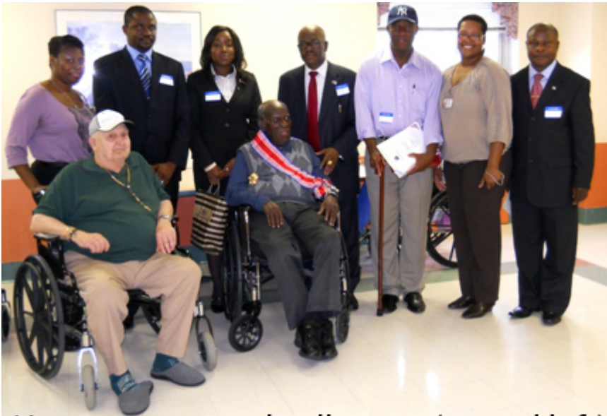
Honoree, son and colleague (seated left) pose with nursing home administrators, and Embassy Delegation.